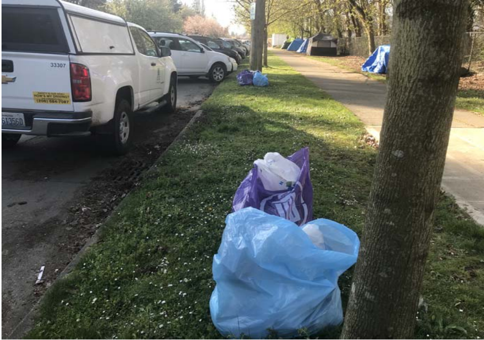
Exhibit D - Clean Up Photos